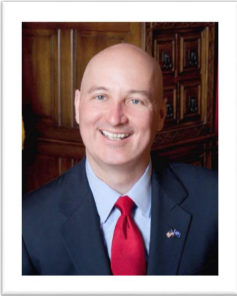
Governor Pete Ricketts Nebraska's 40 th Governor